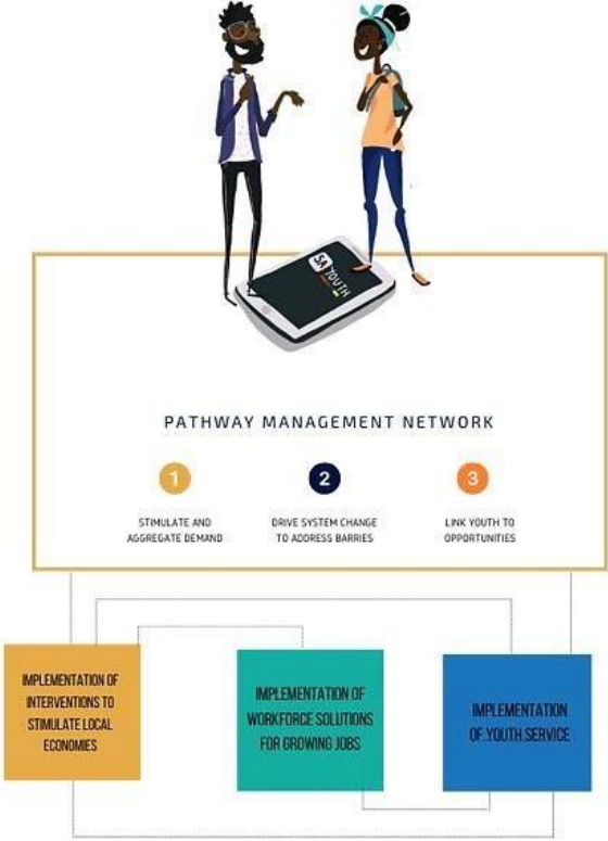
Figure 1 PYEI components

The PYEI sets out priority actions that will both increase levels of alignment across government and create space for innovation in ways that accelerate delivery and catalyse further actions. These interventions are illustrated in the following diagram: